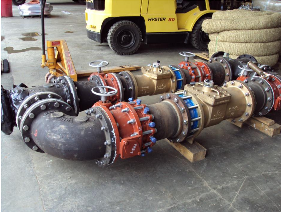
Christen Hill Meter Complex