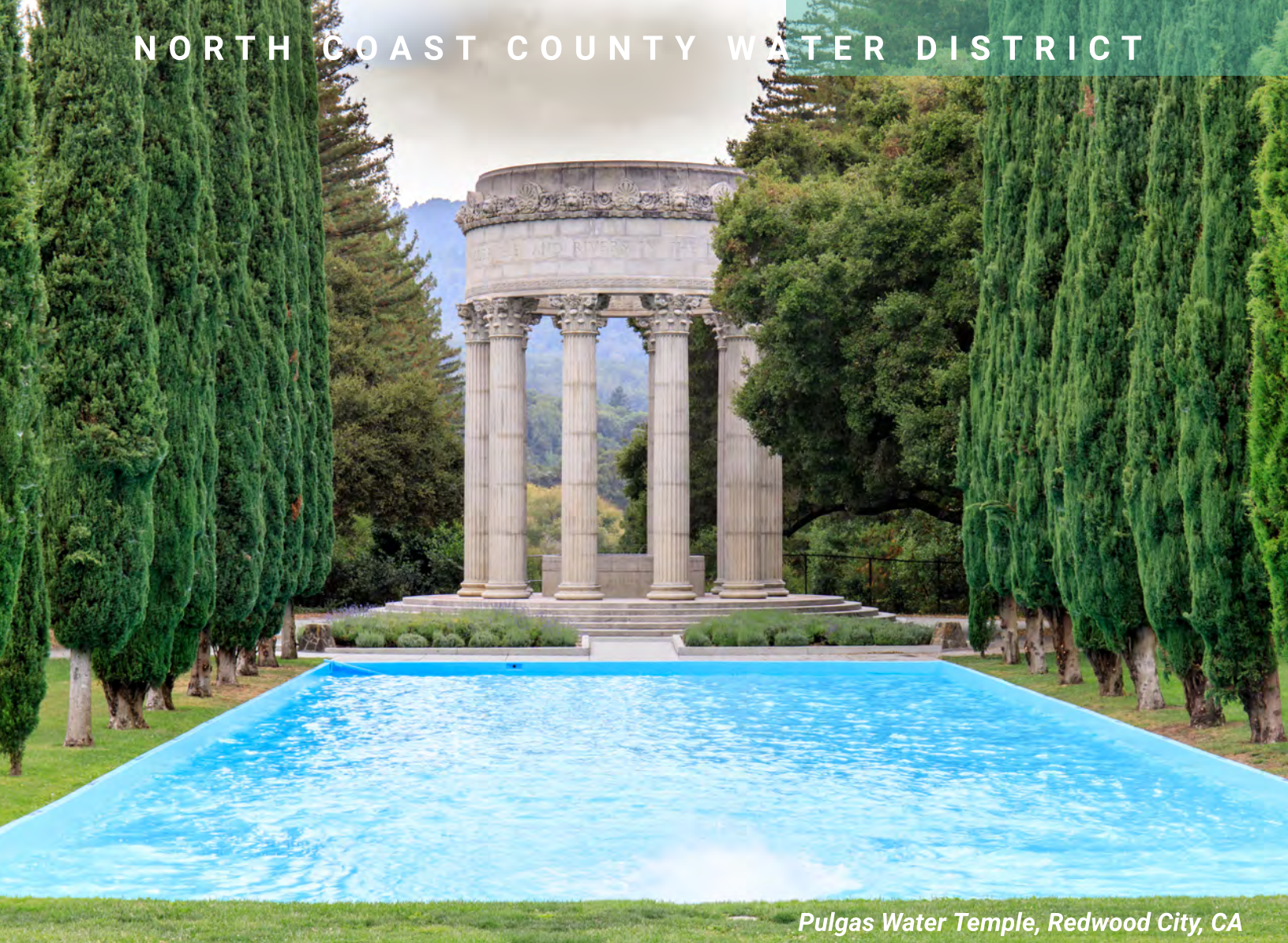
Pulgas Water Temple, Redwood City, CA