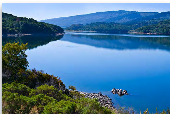
Crystal Springs Reservoir, San Bruno

protected and carefully managed by the San Francisco Public Utilities Commission (SFPUC). These sources are diverse in both the origin and the location with the surface water stored in reservoirs located in the Sierra Nevada, Alameda County and San Mateo County, and groundwater stored in a deep aquifer located in the northern part of San Mateo County.